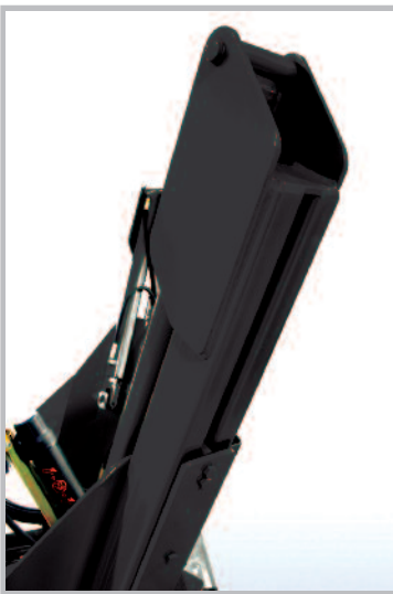
Unique closed design slide channel keeps out unwanted debris.