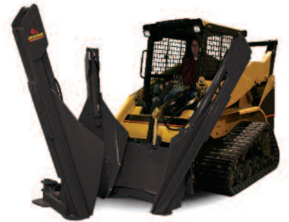
One outside blade swings open.