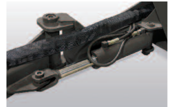
Heavy-duty hydraulic cylinder.

Wide opening swing frame to accommodate evergreens