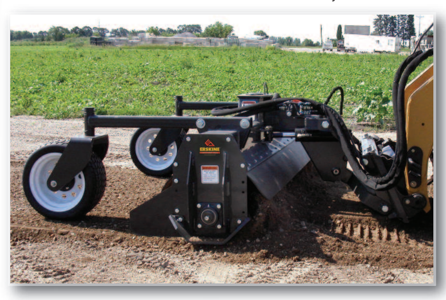
It ransforms your work site or yard from a mess to a seed-ready bed within minutes.