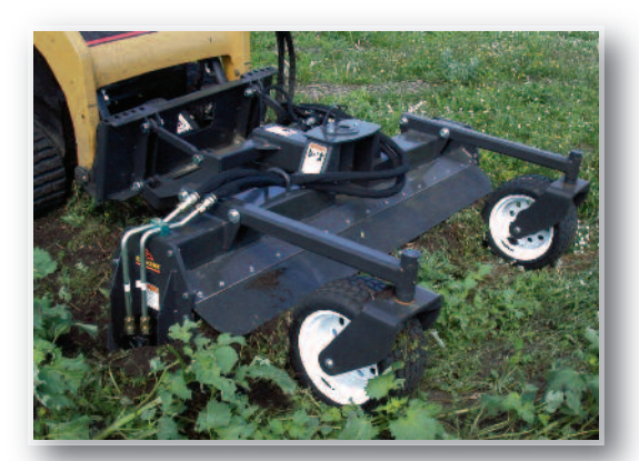
It tills... filling in low spots and chewing off high spots and windrows rock and debris. It creates the perfect seedbed.