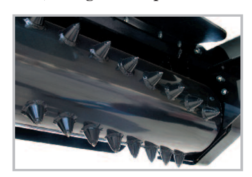
Larger 10" rotor moves a higher volume of dirt than the competition.

chewing off high spots. It creates perfect seedbeds and windrows. This attachment separates rocks, tears up sod, and pulverizes dirt clods. We rake and till deeper than any of our competitors – as deep as 4".