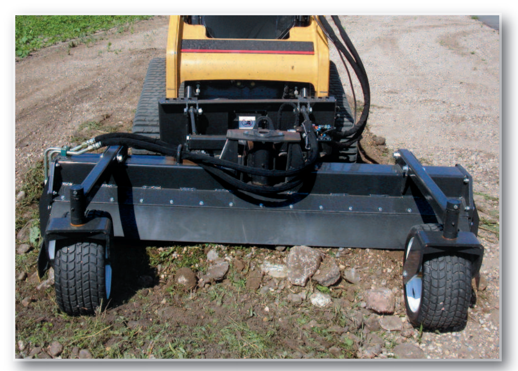
Got a wet, weedy, hard and rocky location? The attachment can flatten and pulverize it... ready for seed.