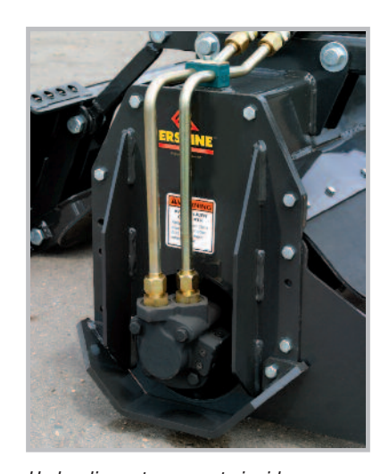
Hydraulic motor mounts inside the exclusive Direct Drive Rotor eliminating reduction chains, sprockets, gears, or bearings.