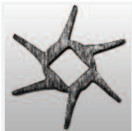
Polyethylene blade type agitator is impervious to moisture and is built to provide many acres of reliable seed metering.