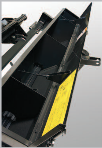
The seed box utilizes a newly designed blade type agitator.