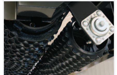
Front rollers crush lumps, press down small stones, and form a firm seedbed while rear rollers split the shallow ridges formed by the front rollers and gently firm the soil around the seeds.

The Landscape Seeder comes standard with a three-point hitch that can be attached to the front or rear of the seeder frame for tractor mount applications.